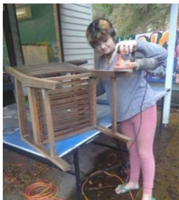
DIY at DVLC. Give the girl a sander! 1